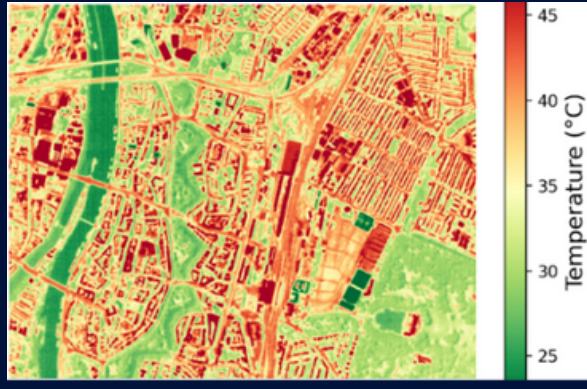
Land-Surface Temperature measured in the Bremen City Center using RAVEN.

Urban areas exhibit highly heterogeneous surface types that are not adequately addressed by satellite observations or generic broadband LWIR cameras. RAVEN was developed to bridge this gap. RAVEN ("Remote Airborne Variable Emissivity and Temperature SeNsor") is an instrument for airborne remote sensing, specifically tailored to the requirements of urban environments and ambient temperatures. RAVEN utilises off-the-shelf hardware to provide high-resolution LWIR images in three calibrated spectral bands. This allows for the simultaneous estimation of surface properties (spectral emissivity) and the corrected surface temperature. The required radiometric accuracy is achieved through a robust calibration approach and an additively manufactured housing with active temperature stabilisation. RAVEN is engineered for use on various airborne platforms and offers a resolution between 0.15 m (100 m altitude / drone) and 4.1 m (3000 m altitude / piloted aircraft).