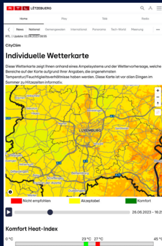
Weather Sensation Service

Beyond assisting with the sensor installations, RTL Luxembourg took on a leading role in sharing the project's results with the public. Through their media expertise, they produced a variety of videos and broadcast articles that aired on TV, providing in-depth coverage of the project's developments and highlighting the importance of climate monitoring. These broadcasts helped raise public awareness of the city's efforts to tackle climate challenges and underscored the importance of staying informed about local weather conditions.