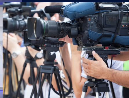
One of several TV reports about the CityCLIM activities on RTL Luxembourg.

Additionally, in collaboration with the city of Luxembourg and private stakeholders, we identified and established ten new monitoring locations across Luxembourg. Two additional sites were designated specifically for wind, improving local data collection and enhancing the project's meteorological accuracy. These new stations not only benefit CityCLIM but also provide valuable data for the city's environmental monitoring efforts.